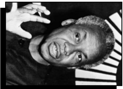
Mwalimu Julius Nyerere Founding President of Tanzania

NON-PROFIT U.S. POSTAGE PAID LOS ANGELES, CA PERMIT NO. 36969